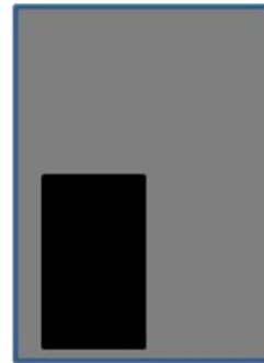
1/4 PAGE AD 3-5/8" X 4-7/8" (21-1/2 picas X 29 picas) Bleed: 4-1/8" X 5-1/2"